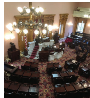
Floor of the Ohio House of Representatives