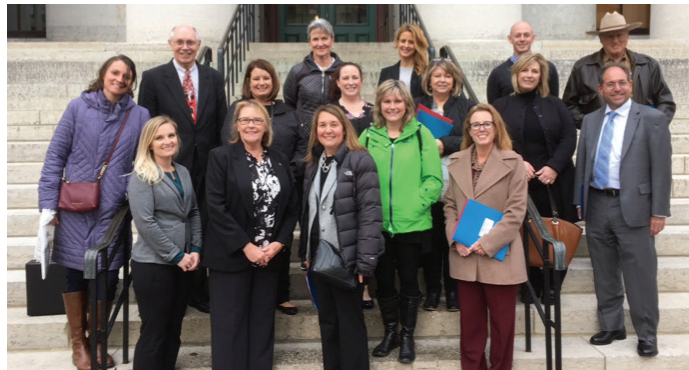
November 2019 Columbus Excursion

The 33rd Project Excellence Banquet will be held May 6, 2020 at the Warren County Career Center. Please nominate a public Warren County educator for selection, nominations are due February 28. Forms will be available in all the Warren County libraries, bank branches of APC member banks and all school buildings the month of February. But the easiest way to nominate is on line - go to http://www.apcwc.org/project-excellence - make sure you fill in the 'text' portion of the form.