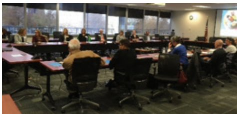
Ohio Department of Education