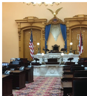
Floor of the Ohio Senate