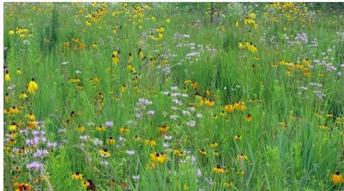
Healthy Prairie / Pollinator Habitat Establishment at Year 5 following 5 years of adaptive management.

Adaptive management strategy – An adaptive management strategy is necessary to ensure the diversity and establishment of native plant communities over time. Adaptive management uses many different approaches, which include: mowing, spot herbicide applications, boom spraying applications and prescribed fire (if or when appropriate). Mowing/weed whacking helps to control annual species or to limit spread before going to seed, while herbicide applications help eliminate unwanted species quickly, but require licensed applicators. Additionally, having knowledge of native plant communities is crucial to the adaptive management, development, and establishment of native plant communities. Experienced applicators can recognize problem species and appropriately spray the correct chemical to the target species while limiting the impact to the native plants. This knowledge is important for both spot and boom spraying activities. Costs for the entire cumulative management acreage includes three (3) visits during the growing season and would generally decrease in effort and cost over time.