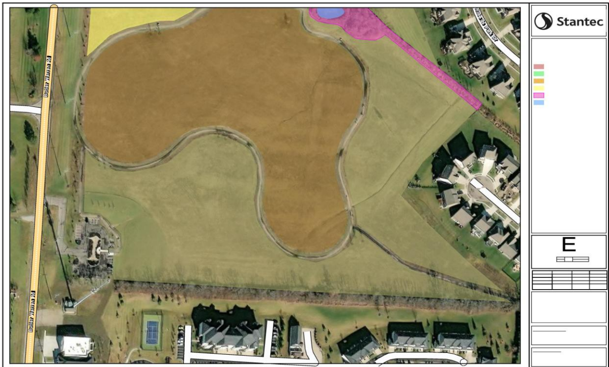
ATTACHMENT 1 ENLARGED