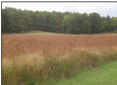
Warm Season Grasses at full establishment (Year 5)

This task is proposed to be completed in Spring of 2026.