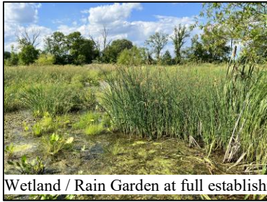
Wetland / Rain Garden at full establishment (Year 5)

This task is proposed to be initiated in late winter / early spring of 2026 and seeded/planted in May-June 2026.